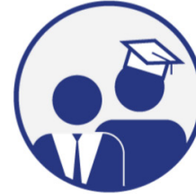
INTERNSHIPS & EMPLOYMENT